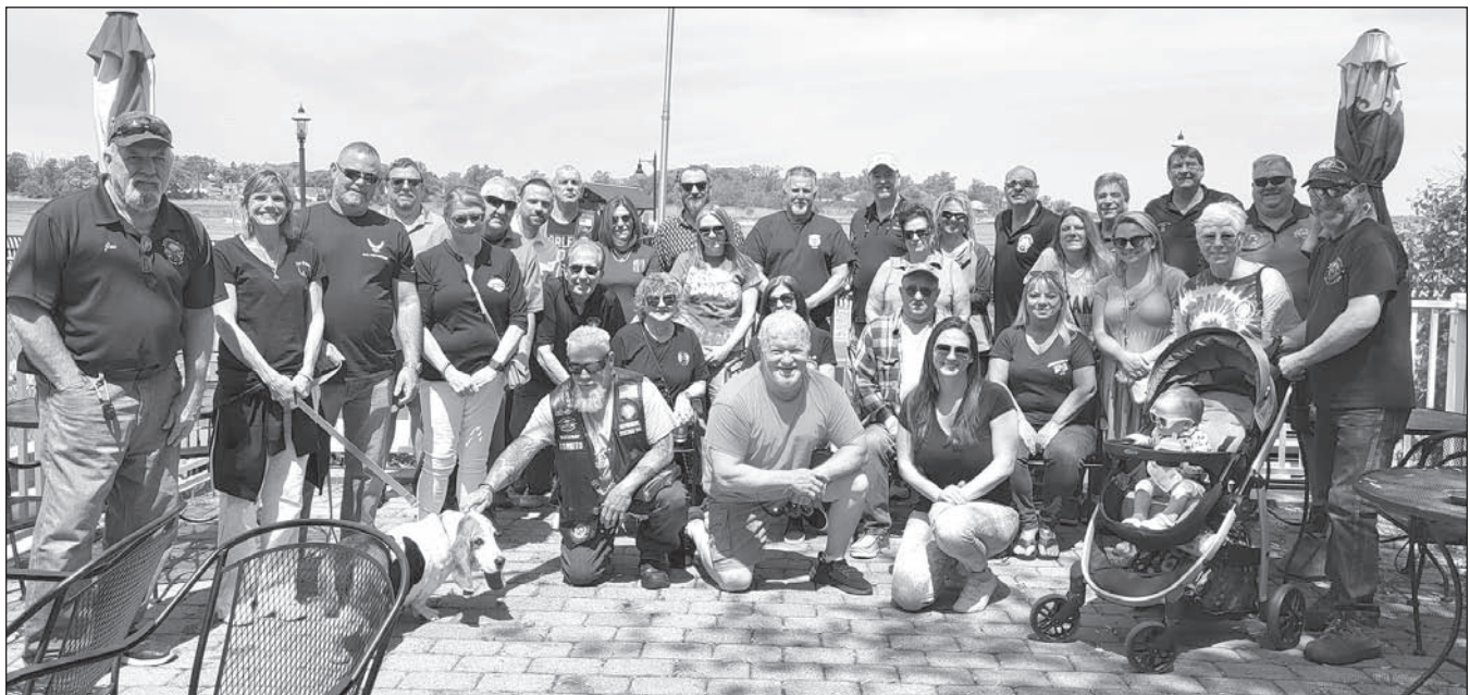
South Central District - Walk Out On Drugs.

Please have vouchers and all other business for our review submitted to the Trustee's mailbox prior to this time.