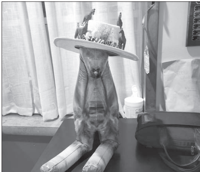
Lucky Lady enjoyed the Derby